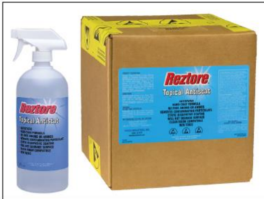
Figure 1. Reztore™ Topical Antistat 1 Quart (1 liter) Spray Bottle 2.5 Gallons (10 liters) Bag-in-Box